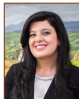
Pilar Garrido Minister of National Planning and Economic Policy (MIDEPLAN), Costa Rica