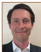
Sami Pirkkala Secretary General of the National Commission on Sustainable Development at the Prime Minister's Office, Finland

Evaluation is crucial in assessing value, worth, and merit of national SDG-related policies, plans, and results, and can generate recommendations on how, in what direction, and how fast to drive change to achieve the SDGs. In crisis contexts, evaluations can contribute towards agility in response, re-routing strategies towards the most relevant SDGs, and adjusting resources with a focus on the most marginalized.