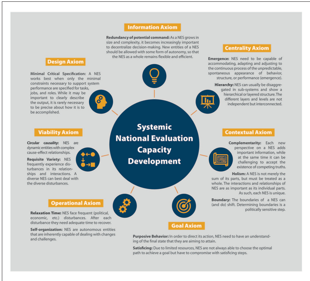
Figure 2. Depiction of the systems construct applied to national evaluation systems.